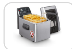
Turbo SF® 4170