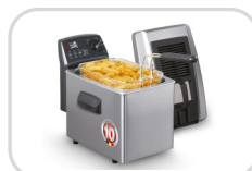
Turbo SF® 4371